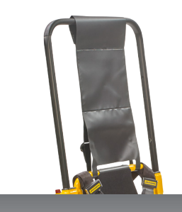
Vinyl head support